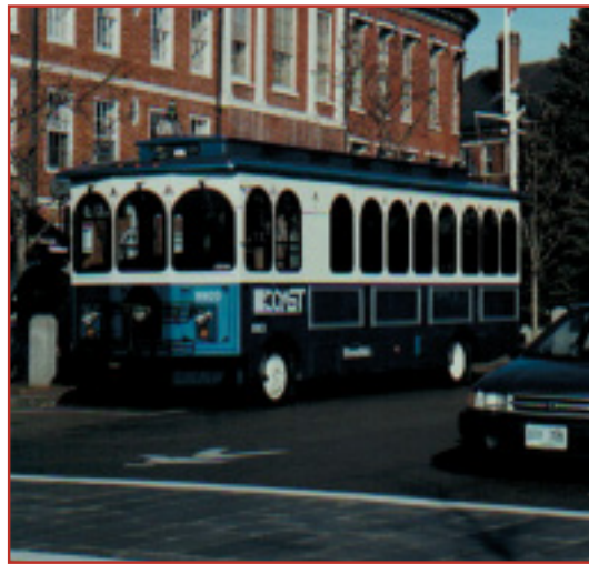
Three trolleys were purchased with CMAQ funds to provide connections between downtown Portsmouth, NH and Pease International Tradeport, facilitating access for residents to jobs, business opportunities and air transportation.

Applications are available at the Regional Planning Commission offices in your area (see list that follows). Completed applications must be submitted to the RPC office within whose jurisdiction the project is located, no later than the end of August of odd-numbered years (e.g., August 2001, 2003, etc.). Applications must include documentation of air-quality benefits resulting from the project proposed.