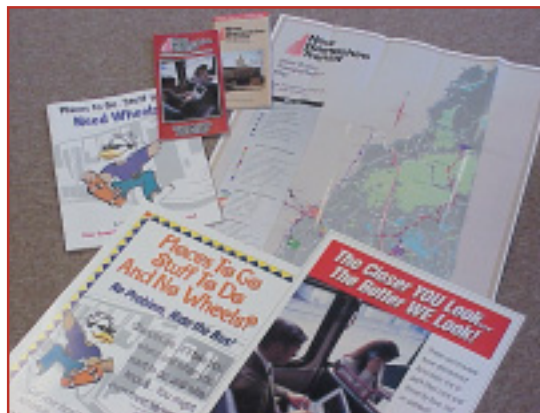
NHDOT also uses CMAQ funds to disseminate information about available commuter services all over the state.