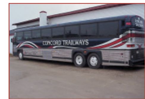
NHDOT used CMAQ funds to build an intermodal park-and-ride facility in Nashua, New Hampshire and to purchase 6 over-the-road bus coaches that are used for commuter services.