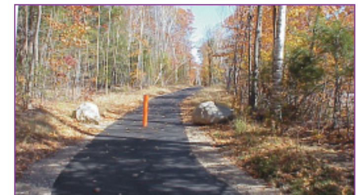
An example of a bike path built with Transportation Enhancement funds in Lincoln, New Hampshire.

Cities, towns, state agencies, private industry and special interest groups may apply for Transportation Enhancement funding for their project. Federal funds will pay up to 80% of the cost of the project, with the applicant being responsible to provide matching funds. Communities are encouraged to "Municipally Manage" their projects, allowing for local decision-making and scheduling to meet community needs.