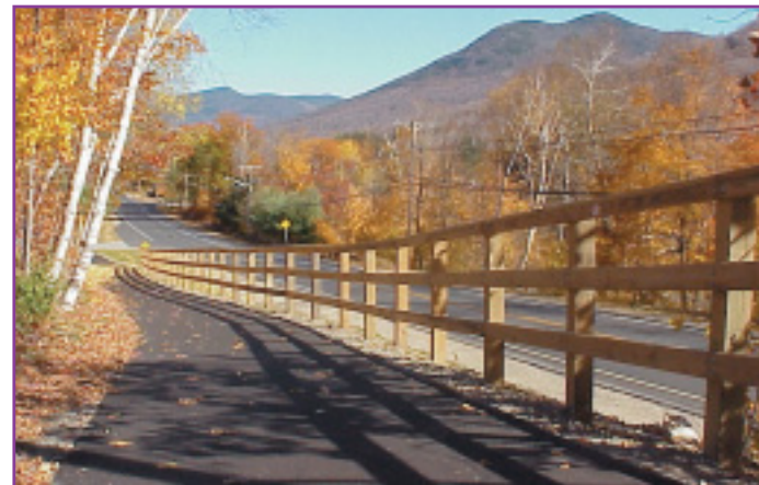
Courtesy of the Transportation Enhancement Program and under the sponsorship of the town of Lincoln, a new multi-use path runs parallel to the Kancamagus Highway and connects the center of town with area resorts.

The application process for Transportation Enhancement funds is a two-year cycle, beginning in June of each odd-numbered year (e.g., June of 2001, 2003, etc.)